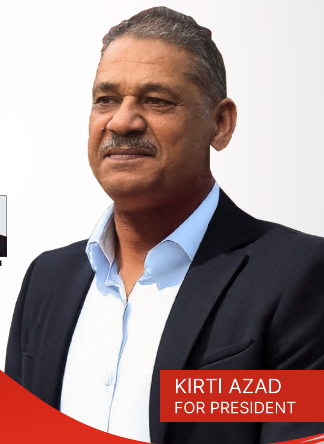
KIRTI AZAD FOR PRESIDENT